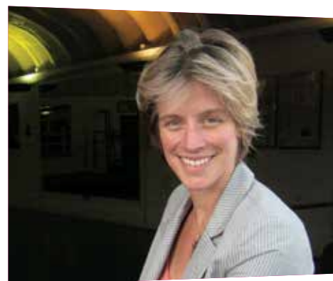
CHARLOTTE LESLIE MP CHAIR OF THE ALL PARTY PARLIAMENTARY GROUP FOR BOXING

In the summer of 2011, London was ablaze. Young people were tearing our streets apart in scenes many thought we would never see in a first world country, let alone our great capital.