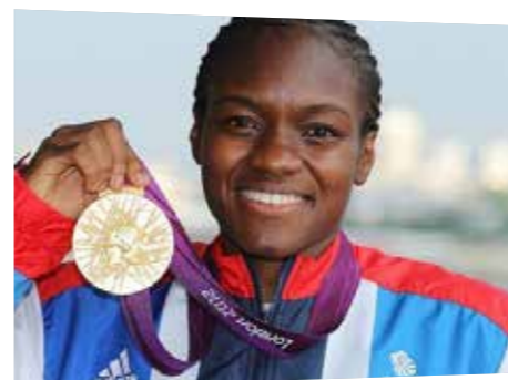
NICOLA ADAMS 2012 OLYMPIC FLYWEIGHT GOLD MEDALLIST AND “AMBASSADOR FOR FIGHT FOR PEACE”

As someone that has been involved in boxing, at all levels, since the age of 12, I have had the opportunity to witness the huge range of benefits that the sport can deliver to people and communities.